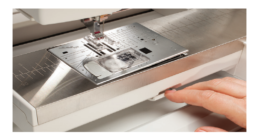
CHANGE YOUR NEEDLE PLATE BY REMOVING THE STORAGE BIN AND PUSHING THE ONE TOUCH NEEDLE PLATE CONVERSION LEVER ON THE FRONT OF THE FREE ARM.

In order to guarantee the perfect 1/4" seam, your 9mm stitch width machine needs to be equipped with the Straight Stitch Needle Plate and be set to the center needle drop position.